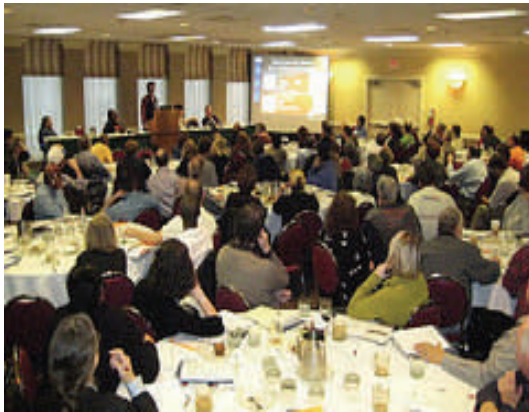
Unionists at January founding conference of Labor Campaign for Single-Payer in St. Louis.

The national kick-off meeting was spearheaded by scores of trade union organizations that had already endorsed the national single-payer bill, HR 676, which was being reintroduced in Congress by Congressman John Conyers along with dozens of House co-sponsors. The bill now has 87 House sponsors. HR 676 has been endorsed by 39 state AFL-CIO federations, 134 Central Labor Councils, and more than 450 local unions.