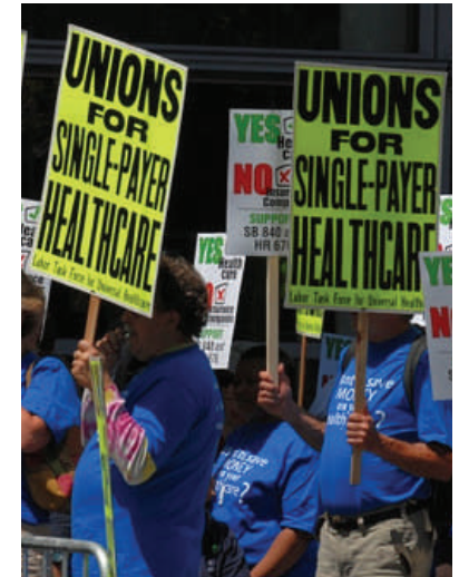
San Francisco Healthcare Rally

Working to bring all labor together on the most fundamental struggle for social justice in our generation—making health care a right for all in America.